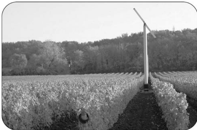
Figure 1. Using wind machines is one method of protecting horticultural crops from cold injury.

Wind machines are tall, fixed-in-place, engine-driven fans that pull warm air down from at least 15 m above ground during strong temperature inversions, blowing it down and out, pushing away and replacing cold air near target crops. This raises air temperatures around cold-sensitive perennial crops such as grapes (Figure 1). Wind machines are not the same as wind turbines, designed to create electricity from wind energy.